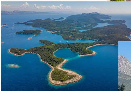
Mljet National Park