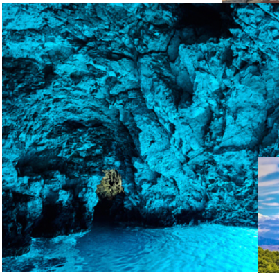
Blue Cave Biševo