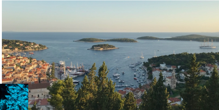
Hvar and Pakleni Islands