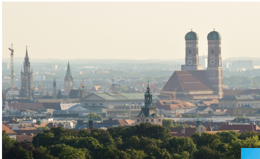
Munich, Bavaria's Capital