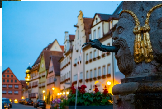
Rothenburg ob der Tauber