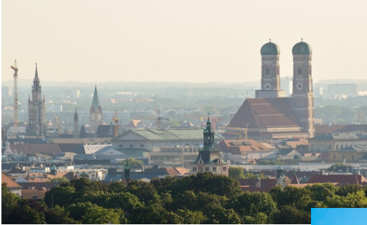
Munich, Bavaria's Capital